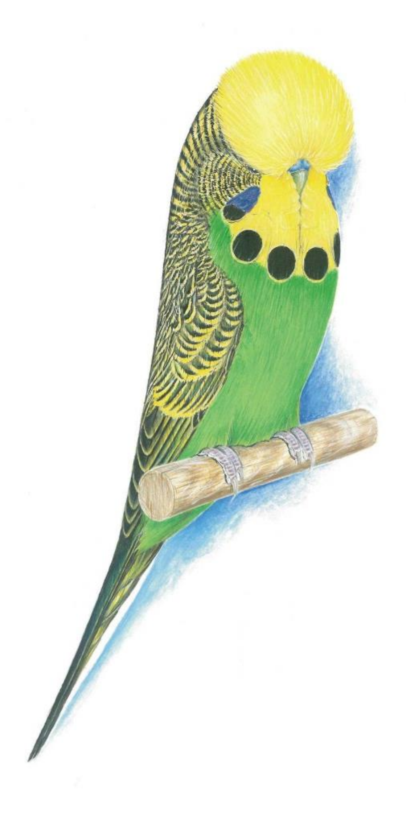
Page 5 of 9

"Our passion is budgies: Never say Never"