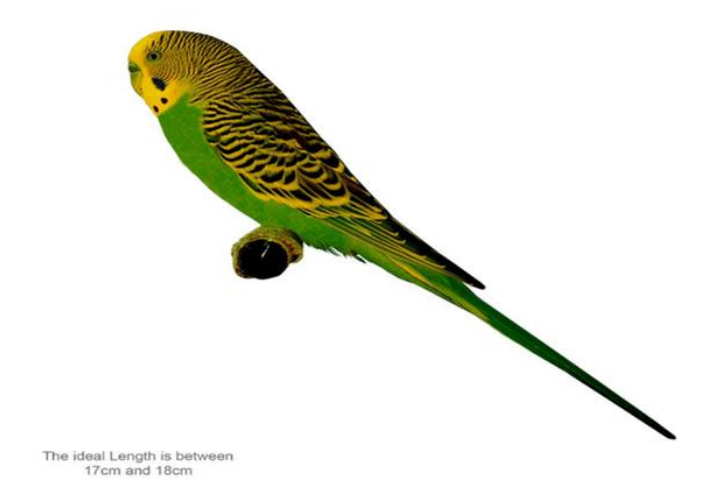
Page 9 of 9