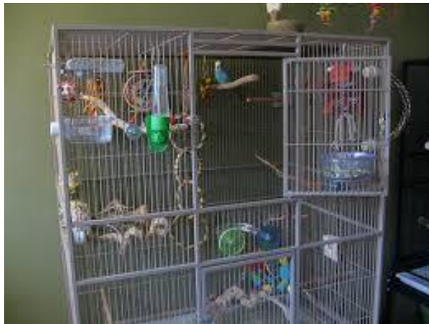
Housed indoors in a beautiful cage