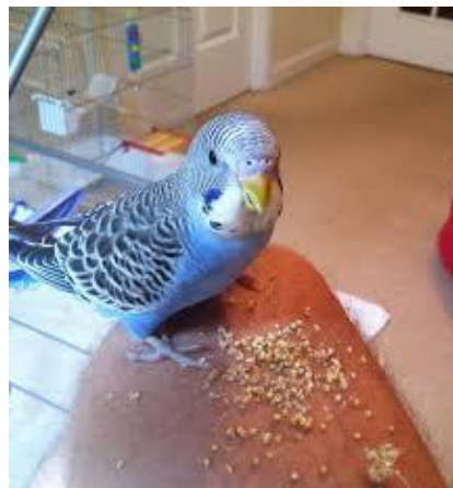
Snack time, no not the bird!