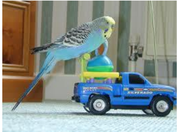
Just check out my truck!