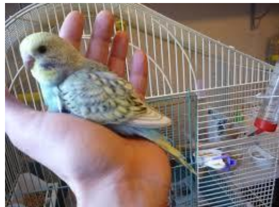
Normally obtained at early age in order for it to be trained