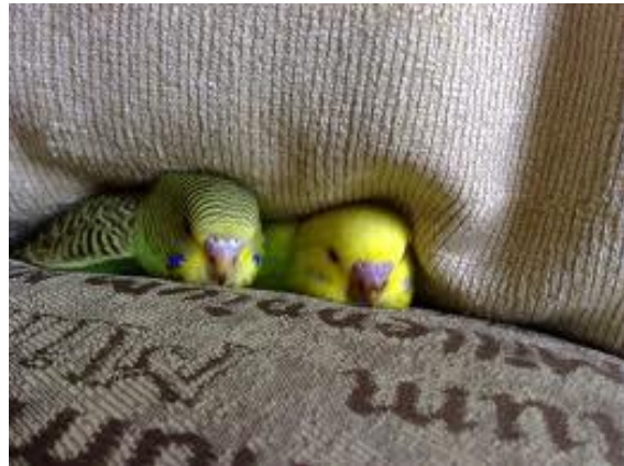
Hide and seek? You could not resist saying: "How Tweet!" could you?