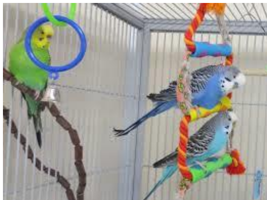
Toys to play with